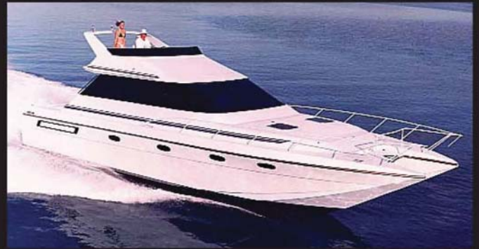
R 408 SPORTS FLY