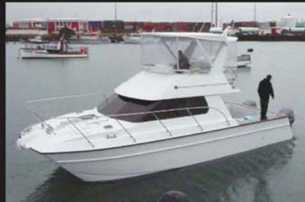
R 1052 FLY