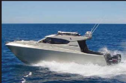
R 1131 COUPE