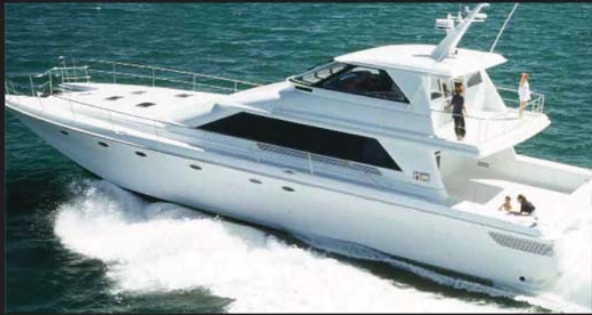
R 846 FLY