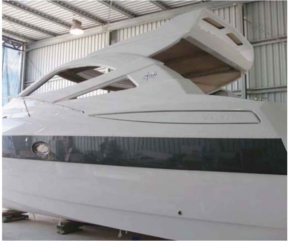
The Javelin J 42 shown just after the hardtop was fitted. It has an electronically operated sunroof.

The other project of interest is a 13.4 metre 'Sports Flybridge', the R 431,