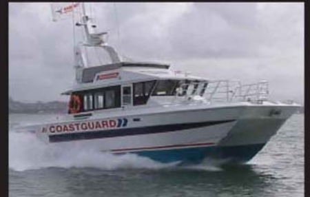
R 1350 PATROL

OVER 30 YEARS EXPERIENCE IN POWER CATAMARAN DESIGN IN GRP COMPOSITES OR ALLOY. ALLOY AND GRP PRECUT KITS AVAILABLE